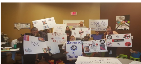
Sign making for the Peace March together with West Vernor Civilian Patrol.

Chadsey Condon partnered with Bridging Communities to offer the Movies on the Green Resource Fair that was a family fun day attended by over 600 residents and 250 children received school supplies provided by Chadsey Condon.