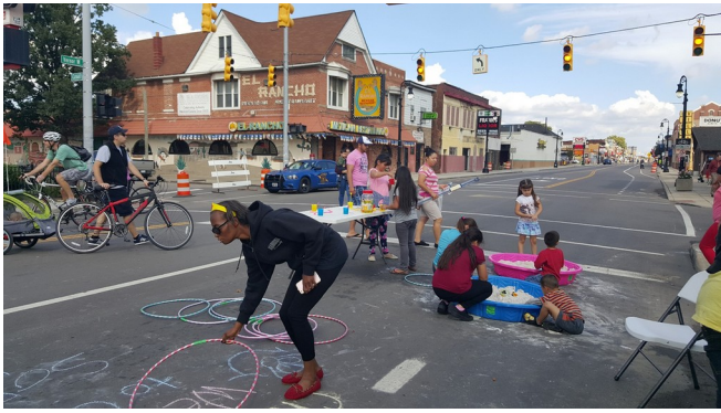
Participating in Detroit's first annual Open Streets on W. Vernor Hwy and making history.

We attended many outreach events at local churches, parks, schools, and other non profit organizations. In 2016 we collected 638 new memberships to add to our contact list of over 1500 Chadsey Condon members.