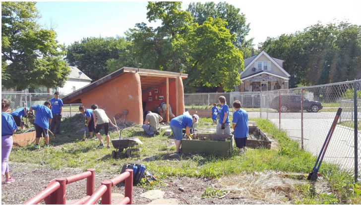
The Mission Continues brought many outside volunteers together to help with a clean up at Priest school . We supported the effort and also hosted a Mission Continues fellow.

106 people attended various trainings about the Detroit Municipal ID hosted by Chadsey Condon. Special thanks to guest speaker Michigan United and the city of Detroit Municipal ID program.